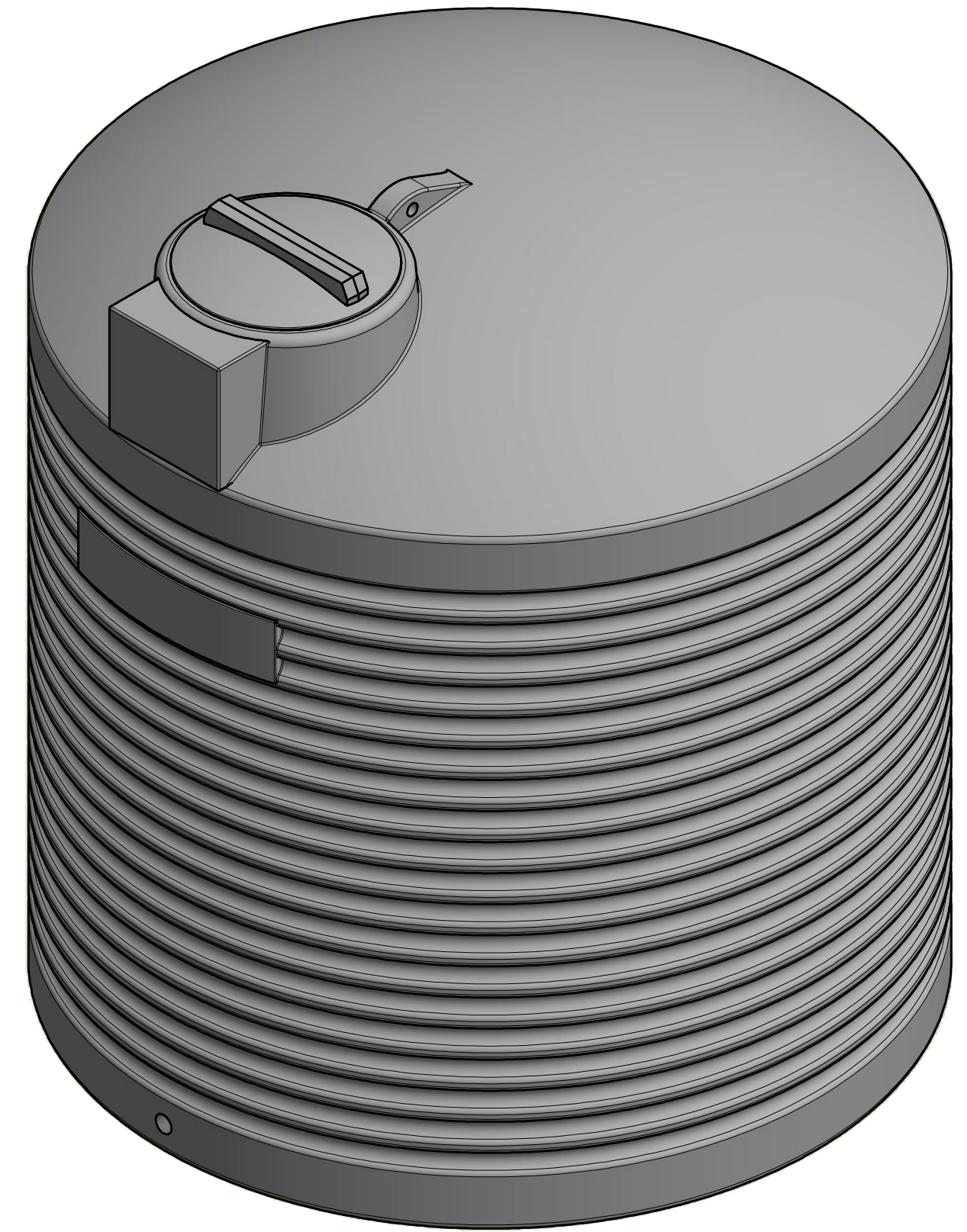
PERSPECTIVE Esc.: 1:10